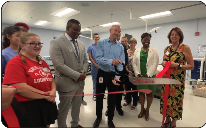
The Surgical Tech Program renovations at the Elkhart Area Career Center are complete! This joint project between EACC and Ivy Tech Community College brings valuable training for high school and adult learners. eacc.elkhart.k12.in.us