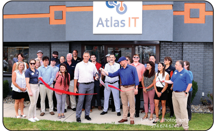
Atlas IT is open in their new location at 410 N Main St, Middlebury. Atlas IT helps your business by providing the talent, knowledge, and systems to keep your technology humming. www.atlasit.org