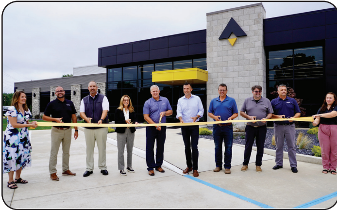
Congratulations to Ancon Construction on their beautiful new facility at 2121 W Wilden Ave, Goshen! What a great way to kick off the celebrations for their 50th Anniversary! www.anconconstruction.com