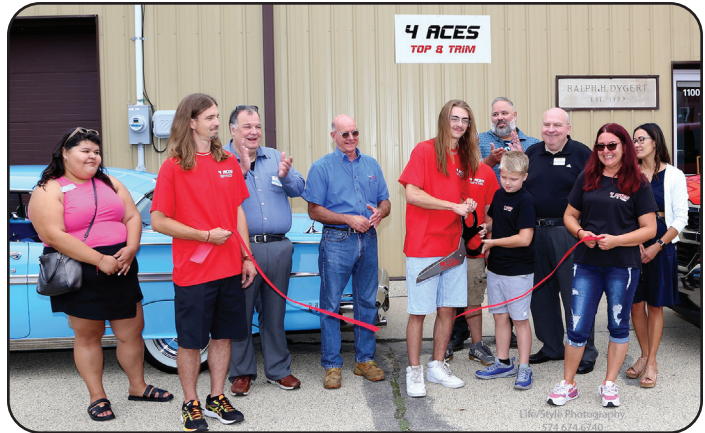
4 Aces Top & Trim celebrates the opening of their new business at 1100 Canton St, Elkhart. They provide custom upholstery work for boats and cars. www.facebook.com/people/4-Aces-Top-Trim/61562700464405/