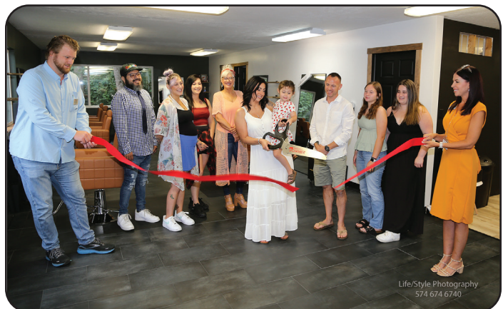
Trim & Tonic celebrates the grand opening of their Barber Salon located at 1789 E Bristol St, Ste B, Elkhart. Trim & Tonic is the only Barber Salon you will find in this area with options for both him and her, www.vagaro.com/trimandtonic