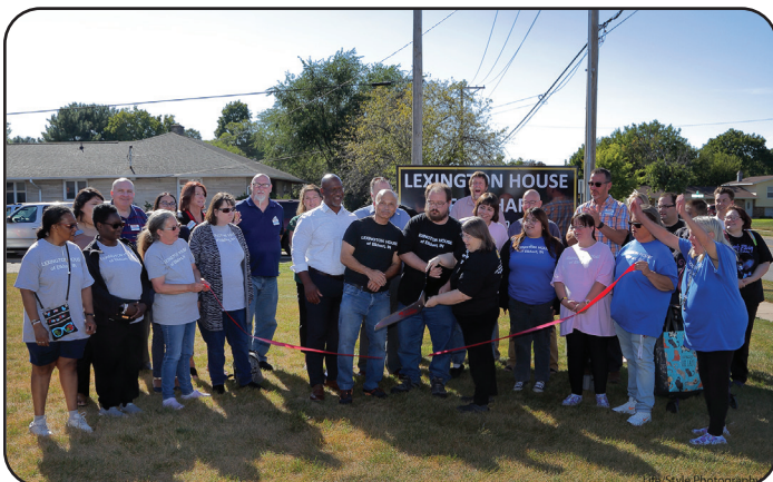
Congratulations to Lexington House on the grand opening of their new location at 311 W Hively in Elkhart. Lexington House is a place to rebuild your confidence and resilience for your mental health wellness journey. www.lexingtonhouse.org