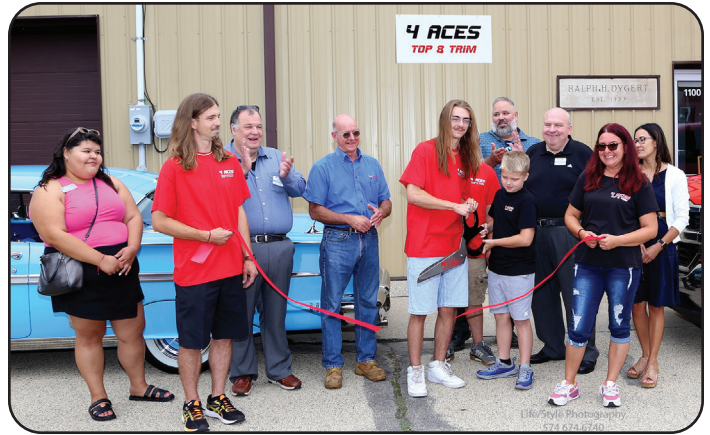
4 Aces Top & Trim celebrates the opening of their new business at 1100 Canton St, Elkhart. They provide custom upholstery work for boats and cars. www.facebook.com/people/4-Aces-Top-Trim/61562700464405/