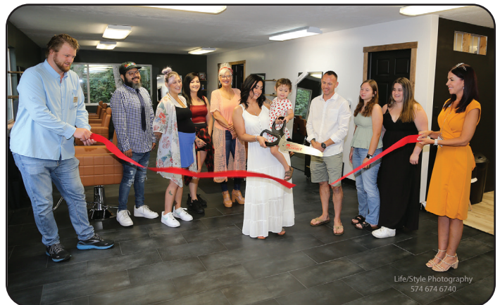
Trim & Tonic celebrates the grand opening of their Barber Salon located at 1789 E Bristol St, Ste B, Elkhart. Trim & Tonic is the only Barber Salon you will find in this area with options for both him and her, www.vagaro.com/trimandtonic