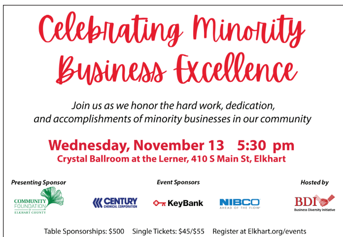
Table sponsorships and individual seats are available. Register at Elkhart.org

The Community Foundation of Elkhart County is the Presenting Sponsor of the event. Event sponsors are Century Chemical, KeyBank, and NIBCO.