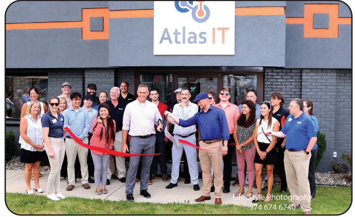
Atlas IT is open in their new location at 410 N Main St, Middlebury. Atlas IT helps your business by providing the talent, knowledge, and systems to keep your technology humming. www.atlasit.org