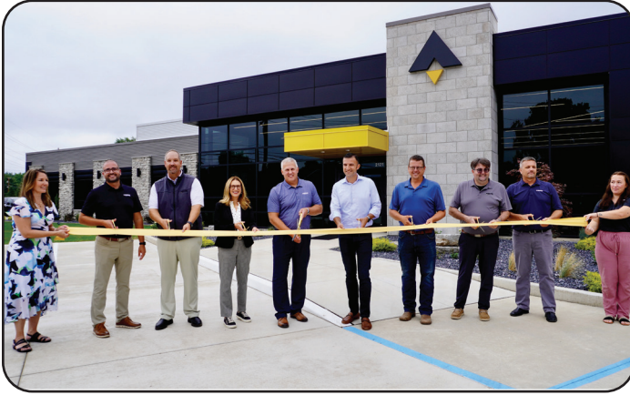
Congratulations to Ancon Construction on their beautiful new facility at 2121 W Wilden Ave, Goshen! What a great way to kick off the celebrations for their 50th Anniversary! www.anconconstruction.com