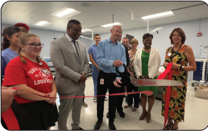
The Surgical Tech Program renovations at the Elkhart Area Career Center are complete! This joint project between EACC and Ivy Tech Community College brings valuable training for high school and adult learners. eacc.elkhart.k12.in.us