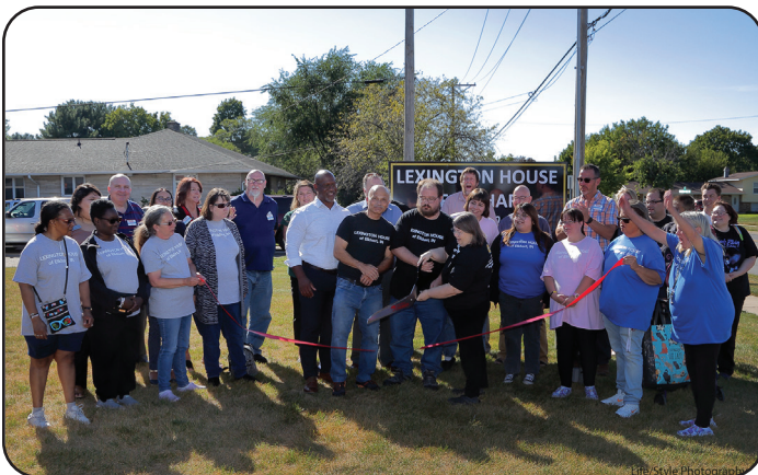
Congratulations to Lexington House on the grand opening of their new location at 311 W Hively in Elkhart. Lexington House is a place to rebuild your confidence and resilience for your mental health wellness journey. www.lexingtonhouse.org