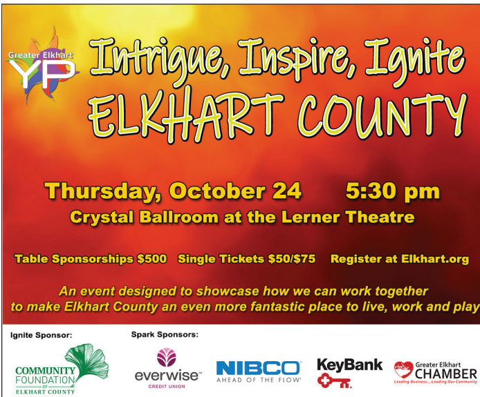
Table sponsorships and individual seats are available. Register at Elkhart.org .

The event begins at 5:30 pm with networking. Dinner will be served at 6 pm, and the program will begin at 6:45 pm.