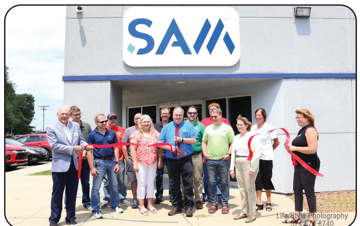
Congratulations, Surveying And Mapping, LLC , on your new location at 2810 Dexter Dr, Elkhart! The multidisciplinary land surveying and engineering company has delivered services to clients throughout the area for more than 100 years. www.sam.biz