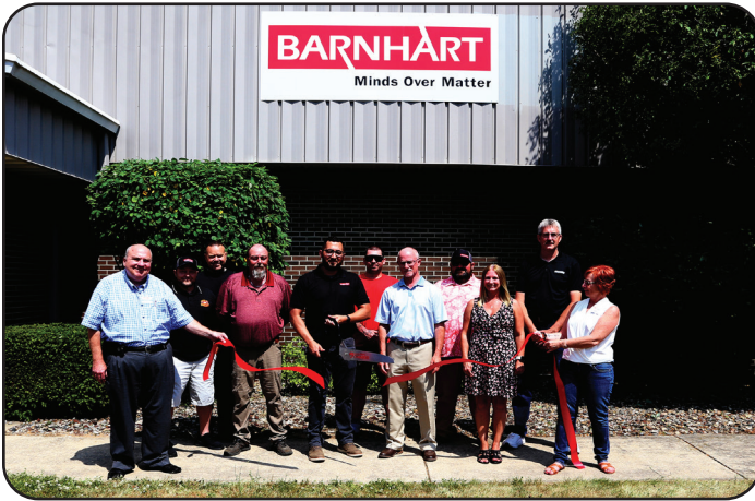
Barnhart Crane & Rigging has expanded into Elkhart! Barnhart has provided installation services and maintenance for over 60 years with dedication to providing superior customer service. www.barnhartcrane.com/elkhart-indiana/