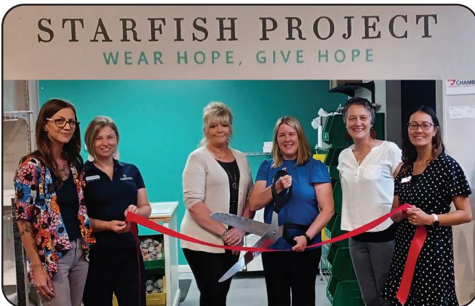
Starfish Project celebrates their new location at 1010 Eisenhower Dr S, Ste A, Goshen! Starfish Project is a Social Enterprise with a Holistic Care Program that cares for women escaping human trafficking and exploitation in Asia. starfishproject.com