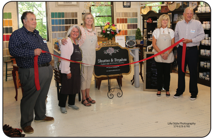
Congratulations, Shutter and Brushes , on your grand opening! Their classes will inspire your creative side. Visit their store, located upstairs at Birds Gotta Fly Vintage, 916 N. Michigan St, Elkhart. www.shutterandbrushes.com