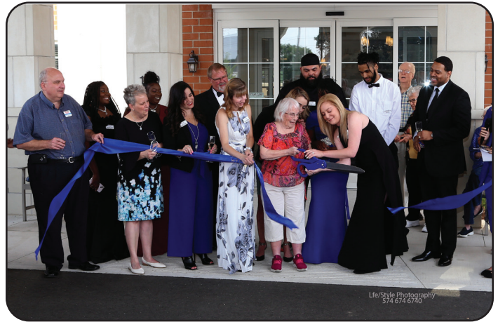
Harmony at Elkhart celebrates their Grand Opening! Harmony, 1129 Parkway Ave, Elkhart, is designed so residents can live the lives they choose in a beautiful, and supportive environment. harmonyseniorservices.com/senior-living/in/elkhart/harmony-at-elkhart/