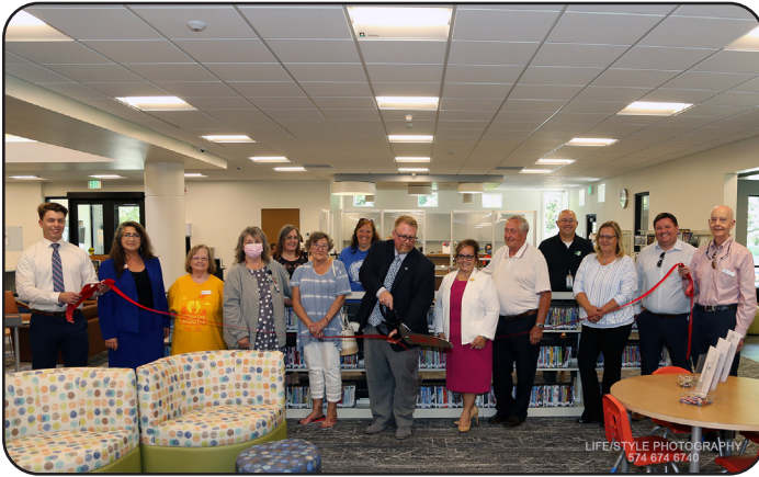
Celebrating the big changes at Elkhart Public Library Dunlap Branch ! All four neighborhood branches of the Elkhart Public Library will be the scene of big changes leading to friendly spaces for studying, collaborating and sharing. www.myepl.org