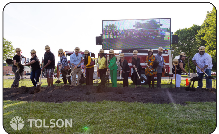
Congratulations, Tolson Center for Community Excellence , as you begin the remarkable next chapter! A true community partnership is creating a revitalized Tolson Center rooted in South Central Elkhart. www.tolson.org