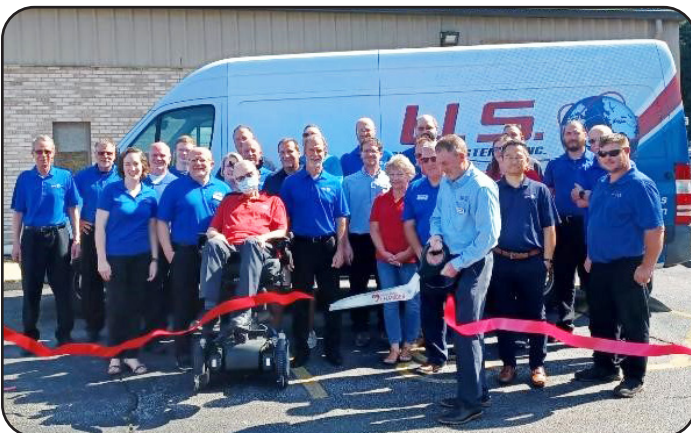
US Business Systems says Thank You to clients, partners and the community! They are honored to have served local businesses for the past 3 decades. Cheers to the next 30 years! www.usbus.com