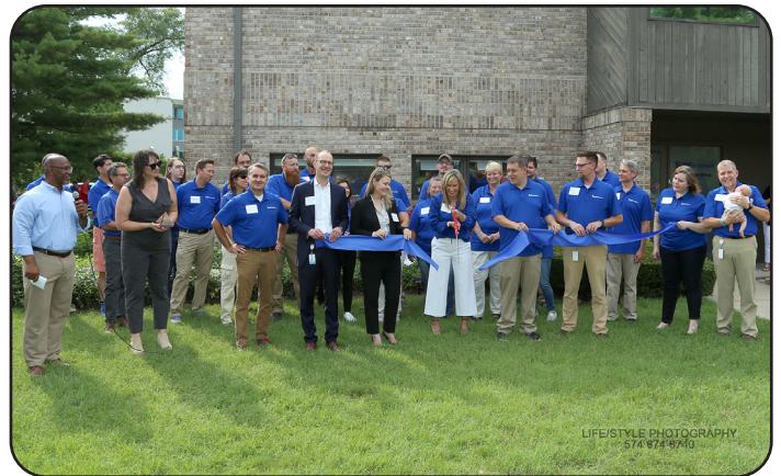
Surf Internet celebrated their continued expansion in the Elkhart community by hosting a Ribbon Cutting Ceremony and Business After Hours event at their new offices located at 228 Waterfall Dr., Elkhart. www.surfinternet.com