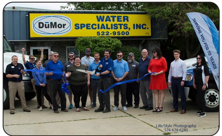
DuMor Water Specialists, Inc. celebrates their 70th year in business! DuMor is located at 4405 Wyland Dr, Elkhart. Learn more about their services at www.dumorwater.com .