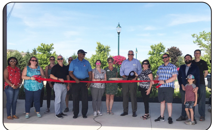
The Lerner on the Lawn Concert Series is collaborating with ArtWalk in Downtown Elkhart for the FREE concerts to be held on The Central Green of Civic Plaza. www.thelerner.com