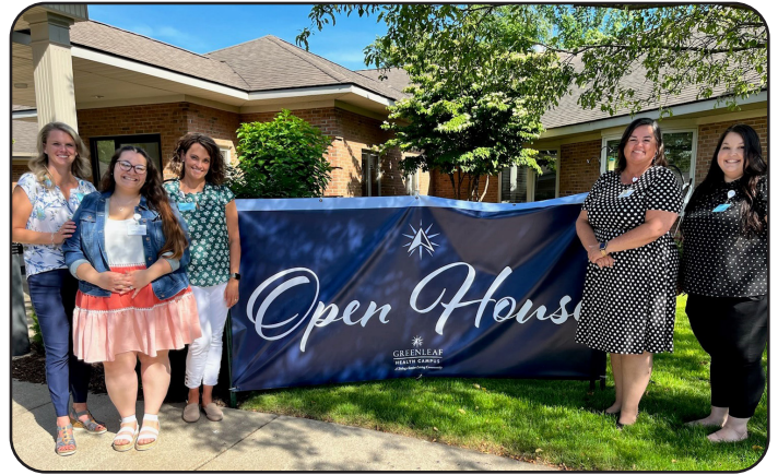
Greenleaf Health Campus located at 1201 E Beardsley Ave, Elkhart, hosted an open house to celebrate their newly remodeled assisted living facilities and introduce new team members. Learn about their newly added services at www.greenleafHS.com .