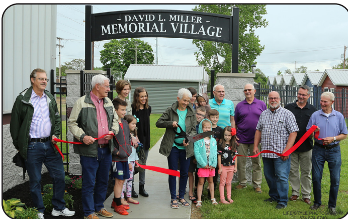
Faith Mission of Michiana officially opened the David L Miller Memorial Village at 801 Benham Ave., Elkhart. Residents receive support while overcoming barriers to obtaining long-term goals. www.thefaithmission.org