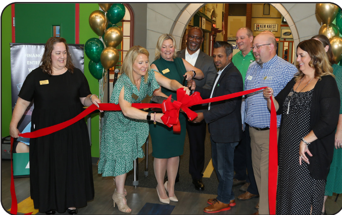
Congratulations to Junior Achievement & Lemonade Day serving Elkhart County on the grand opening of JA BizTown Elkhart , located at 1025 N Michigan St, Elkhart. www.jalemonade.org .