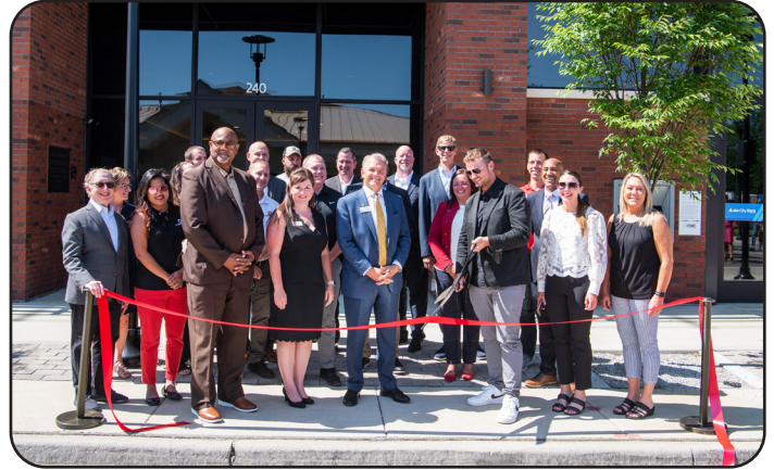
The Riverbend Building in Elkhart's River District is open! Located at 240 E. Jackson Blvd, the building is home to Lake City Bank, Edward Jones, We Impact Group, Community Foundation of Elkhart County, and Bird in the Hand restaurant.