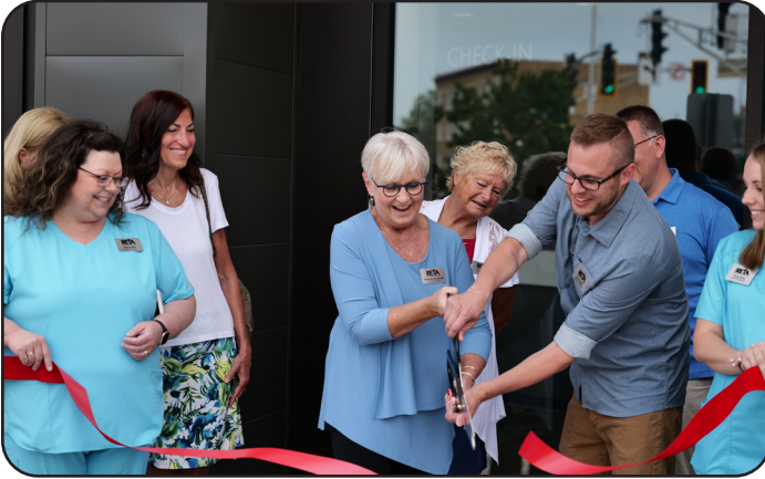
RETA celebrates the move into their beautiful new building at 116 W Jackson Blvd., Elkhart, with a Ribbon Cutting Ceremony. Learn more about RETA (Reason Enough To Act) and the services they offer at www.retaforlife.com .