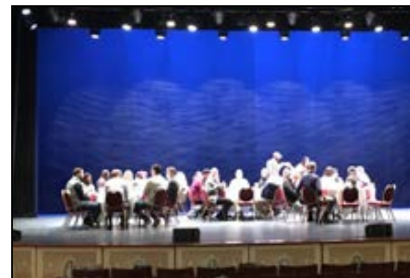
The Academy shines in the spotlight with lunch on the stage at the Lerner. Tours during the day also included Midwest Museum of American Art and Ruthmere Mansion.