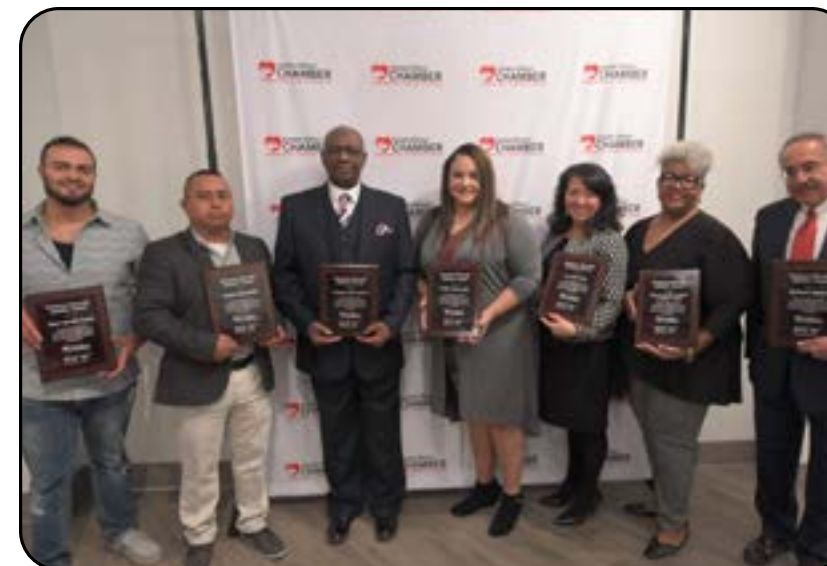
Congratulations to the 2021 Minority Business Excellence Award winners!

The Business Diversity Initiative of the Greater Elkhart Chamber of Commerce presented the Minority Business Excellence Awards to recognize minority businesses and the impact they have in our community.