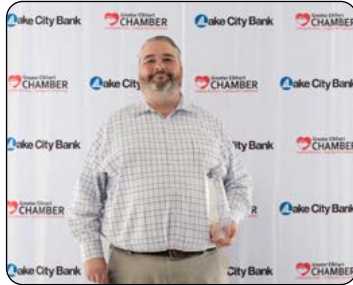
Congratulations, LaVanture Products , Greater Elkhart Chamber of Commerce 2021 Business of the Year!

LaVanture Products Co., founded in 1969 in downtown Elkhart, warehouses and distributes a wide variety of products to general industry and original equipment manufacturers. Their line of products includes such items as trims, foam tapes & seals, hardware, truck/automotive accessories and many other specialty items.