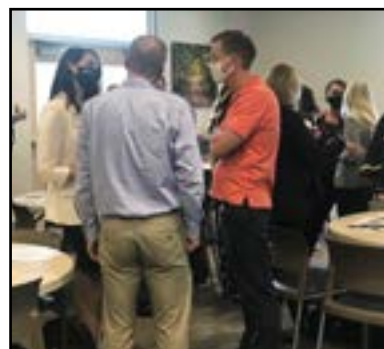
Academy members meet one another for the first time at orientation. Networking contributes to social well-being, and leads to the exchange of ideas and opportunities for mentorship.