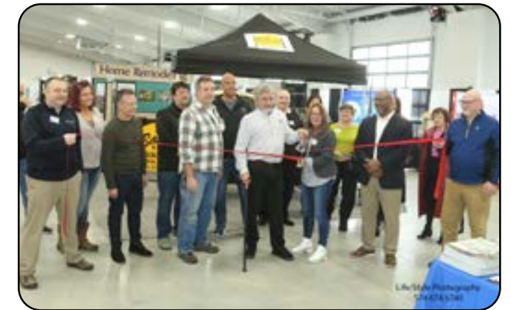
The Builders Association of Elkhart County Home & Outdoor Expo held at the Northern Indiana Event Center opened with a Ribbon Cutting Ceremony. Professionals were ready to discuss improvements for your home and outdoor areas! www.BAEC.com