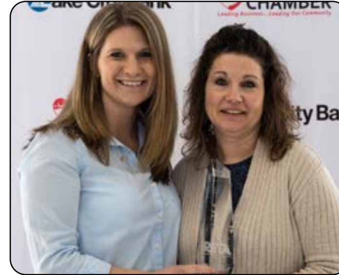
Congratulations, RETA (Reason Enough To Act) , Greater Elkhart Chamber of Commerce 2021 Nonprofit of the Year!

RETA is a faith-based, pregnancy clinic and family resource center located in downtown Elkhart. Established in 1985, they provide services and help for those facing an unplanned pregnancy; for new parents or new grandparents, for men who want to make a better life or learn to be good dads, and women who want to become good moms. Their mission is to provide life-affirming services and build Christ-centered families.