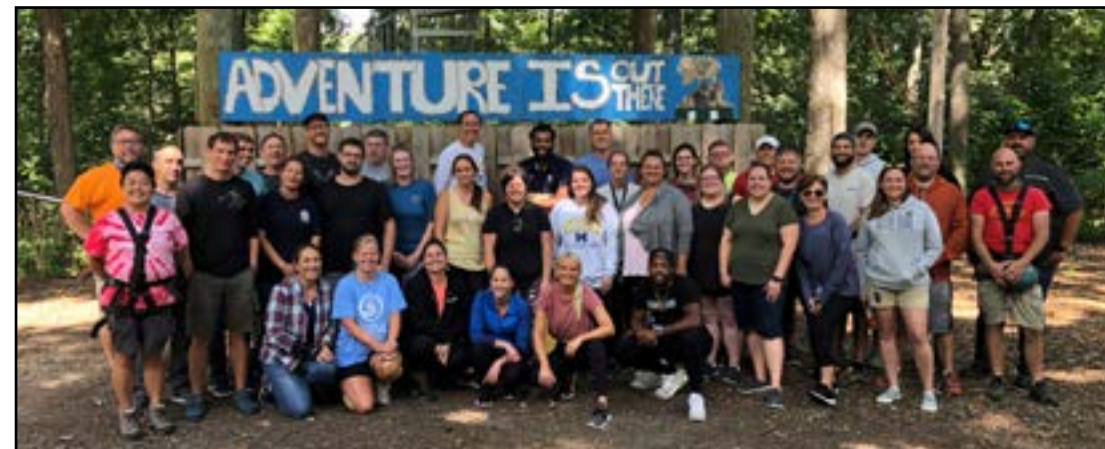
The overnight retreat is the second session in the Academy schedule. The retreat enables participants to access different parts of their minds, create new curiosity, and generate good will. Participants gain new perspectives on team building, personality styles and communication.