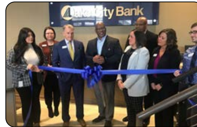
Lake City Bank officially opened the Elkhart River District office with a Ribbon Cutting Ceremony. This is their 52nd office and is located downtown at 240 E Jackson Blvd, Ste 103, Elkhart. www.lakecitybank.com