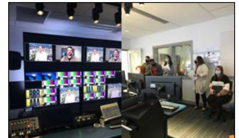
Academy members view the studio interviews on monitors in the control room. Interviews with a reporter or talk-show host can be a win-win: they get an interview to fill air-time or column, and you get an opportunity to share your agenda or point-of-view.