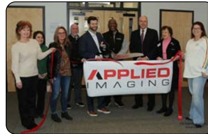
Applied Imaging is excited to announce the acquisition of Advanced Imaging Solutions. Applied Imaging will proudly continue to service customers throughout Northern Indiana with the same familiar personnel. www.appliedimaging.com