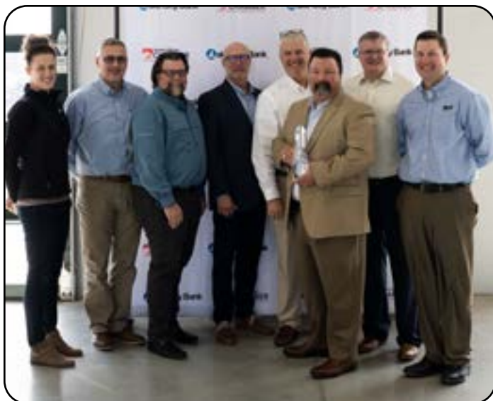
Congratulations, Godfrey Marine , Greater Elkhart Chamber of Commerce 2021 Century Plus Community Award Winner!

Many of the standards in the pontoon boating industry were originally innovations created by Godfrey Marine. It was Godfrey Marine who first introduced the aluminum pontoon boat in 1958 at the Chicago World's Fair. They continued innovating by introducing the original deck boats in the 1970s and they continue the tradition of innovation today.