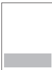
1/4 Page Horizontal Full Color Ad 9.25" x 2.5"