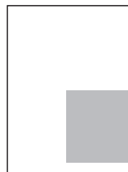
1/4 Page Vertical Full Color Ad 4.5" x 5.574"