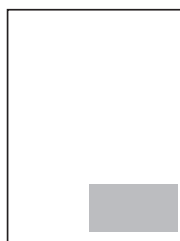
1/8 Page Full Color Ad 4.5" x 2.5"