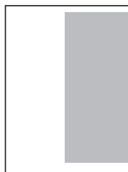
1/2 Page Vertical Full Color Ad 4.5" x 11.4286"